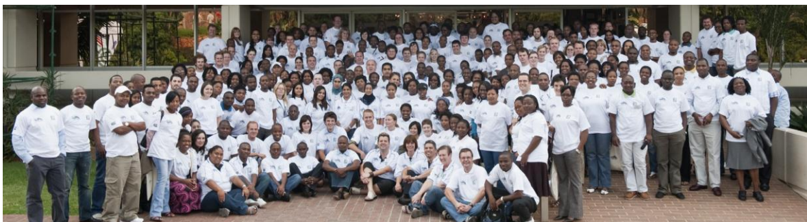
Conference photograph during the 1 st YWPC, January 2010