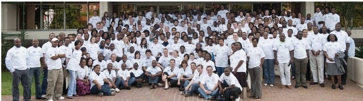
Conference photograph during the 1 st Regional SA YWPC, January 2010